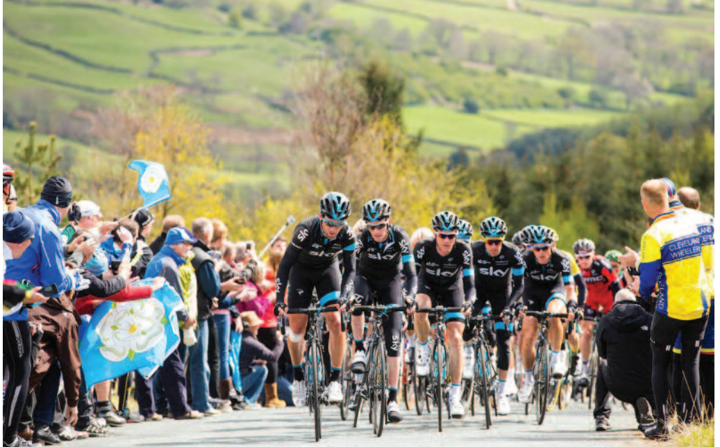
Tour de Yorkshire last year 2015—Stage One —Team Sky took to the front to control the opening stage of the race Kirkby Day-May 1st-timings