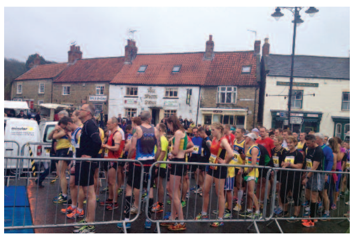
Runners assemble for the start of the 10K race, Kirkbymoorside Market Place last year, 2015